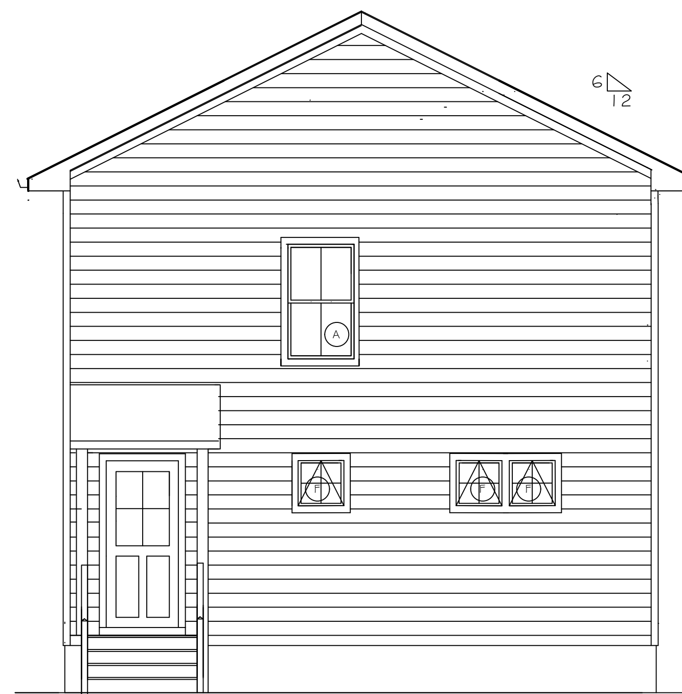
Rear Elevation SCALE: 1/4"=1'-0"

HABITAT for HUMANITY CHOPTANK 29349 W. MAPLE AVE. SUITE 3, TRAPPE, MD. 216673